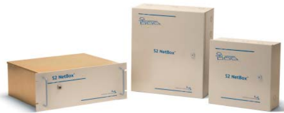
Several enclosure options are available for S2 NetBox systems.

Software for the entire system is embedded in flash memory and updates are delivered online and completed in a single operation. Data storage is provided in flash ROM, removable compact flash, or over the network using network attached storage (NAS) or FTP.