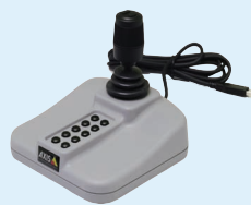
AXIS 295 Video Surveillance Joystick